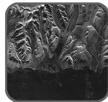
COSMO-SkyMed image of the Northwest Passage, Baffin Islands.

In 10.2 we offer improved support for RADARSAT-2. This dual polarized satellite outputs imagery ranging in resolutions from three to one hundred meters, and can image areas north of 70 degrees daily. A number of enhancements have been made to correctly and efficiently read RADARSAT-2 data into OrthoEngine. In addition to this, improved support for TerraSAR-X has been implemented. This includes additional support for the high resolution X-band SAR imagery provided by TerraSAR-X. Support has been extended to include TerraSAR-X level 1b SSC data, as well as level 1b Geocoded Products (GEC and EEC).