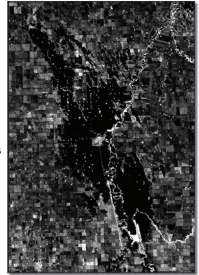
RADARSAT-2 data shows annual flooding of Red River near Winnipeg, MB, Canada